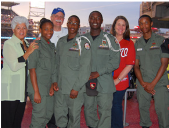
DC cadets with Reps. Grace Napolitano, David McKinley and Diana DeGett