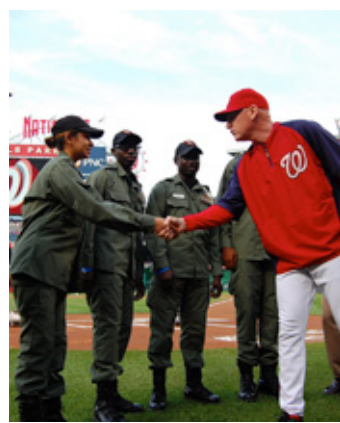
DC cadets with Nationals Manager Matt Williams

NGYF was able to raise awareness on Capitol Hill by being the featured charity at the Congressional Night with the Washington Nationals at Nationals Park. Cadets of the Capital Guardian Youth ChalleNGe Academy represented ChalleNGe at the game.