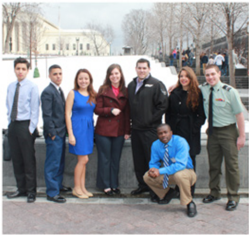
2014 ChalleNGe Ambassadors

To help tell the ChalleNGe story, CHALLENGE GRADUATES are serving as Ambassadors to represent the program and NGYF at national and local events.